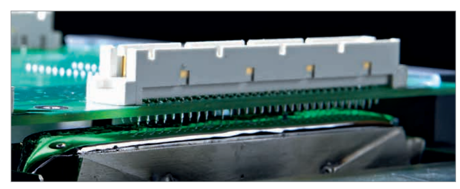
Desoldering of a connector