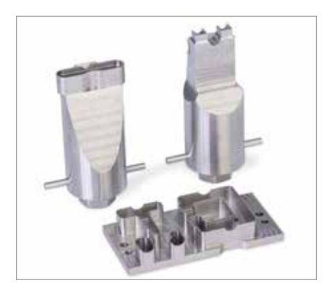
Custom made dip nozzle