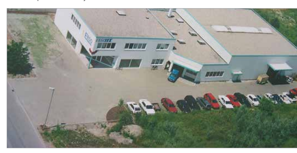
EBSO Headquarter in Germany