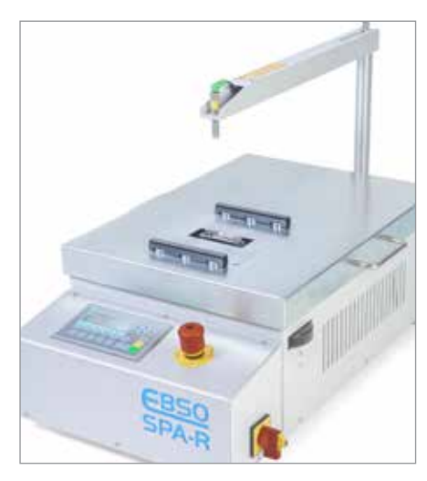
SPA-R with laserpointer to easecomponent centering over nozzle