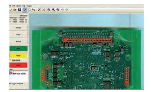
Use friendliy and intuitve software

Use a CAD Image or a scan of the bare PCB board and click on the position you want to solder. Use the default settings and fine tune in necessary. Import of Gerber datas or CAD datas possible.