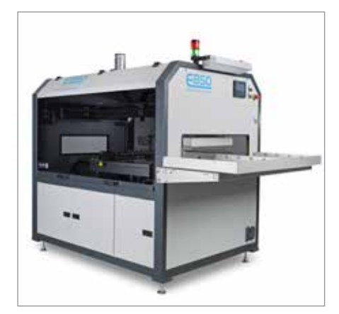
Soldering system with charging station