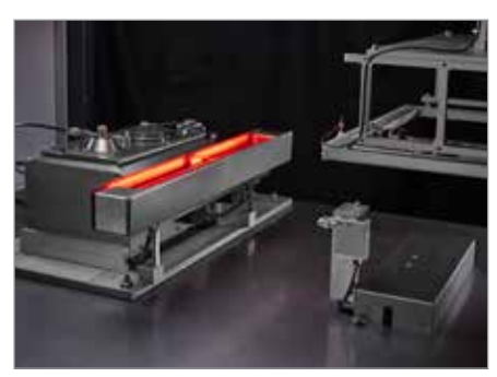
Processing room of the soldering system

Since we introduced the SPA 300-F / SPA 400-F to the market in 2003 more then 450 machines has been installed so far.