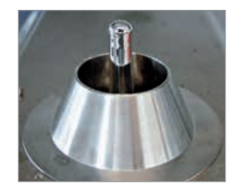
Miniwave with overflow wetable solder nozzle