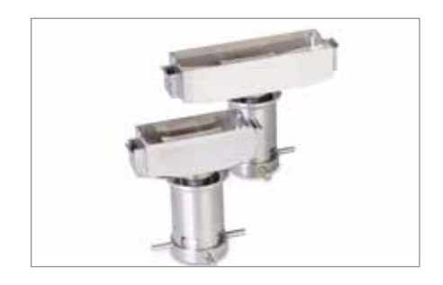
Different solder nozzle sizes and customized nozzles