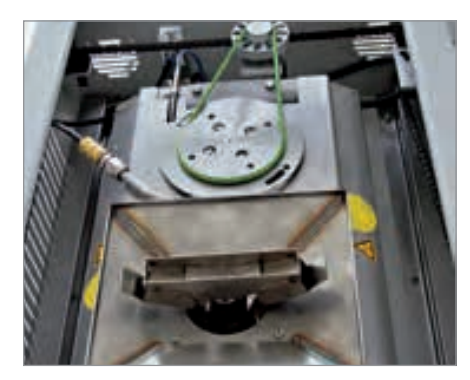
SPA-R insight straight forward engineering