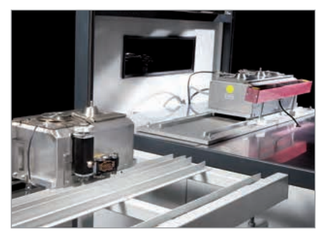
Comforable and fast change via loading table