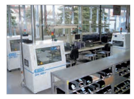
Production at Werma Signal Lights in Germany: 3 SPA machines, inbetween operator working place insures highest flexibility and throughput - always 3 different (or same) products are in production at the same time