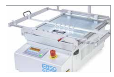
XY-Table with position fixing