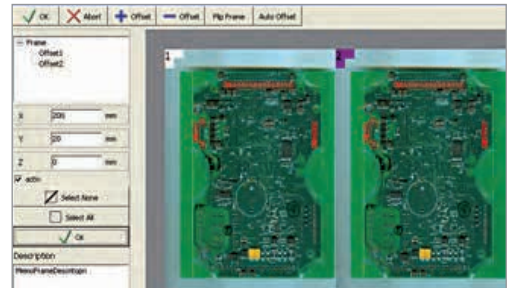
Automatic multiplying of panelized boards with bad mark function