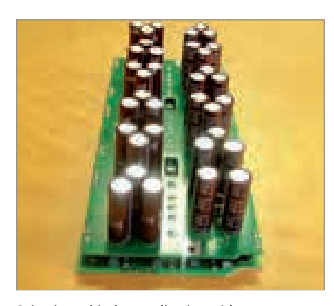
Selective soldering application with 45 mminterfering edge